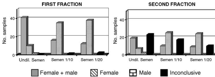
Fig. 1. Haplotype results in first and second fractions.